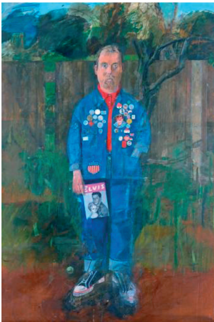
Self-portrait with Badges by Peter Blake, 1961 © Peter Blake. All rights reserved, DACS 2011. Tate, London 2007