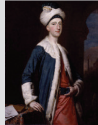
John Montagu, 4th Earl of Sandwich (1718–92) by Joseph Highmore, 1740 NPG 1977

Aged nineteen, Sandwich made an intrepid Grand Tour to Italy, Greece, Turkey and Egypt. This portrait celebrates his adventure and shows him wearing the exotic fur-lined costume – complete with turban and dagger – that he adopted when travelling in the East. His experiences and interests are illustrated in the view of Istanbul's Hagia Sophia and the drawing of the Pyramids on the table.