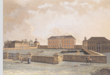
The North Front of Beningbrough Hall by J. Bouttats and J. Chapman, 1751 NT