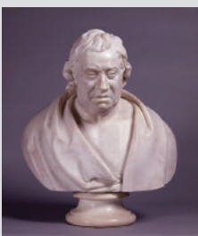
Samuel Johnson (1709–84) by Edward Hodges Baily (1788–1867) after a bust by Joseph Nollekens (1737–1823) Marble, 1828 (1777) NPG 996