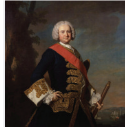
Sir Peter Warren (1703/4–52) by Thomas Hudson (1701–79) Oil on canvas, c.1751 NPG 5158