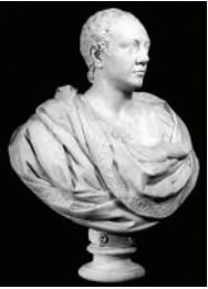
John Perceval, 1st Earl of Egmont (1683–1748) by Vincenzo Felici (active 1701–7) Marble, 1707 NPG 1956