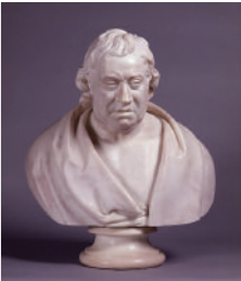
Samuel Johnson (1709–84) by Edward Hodges Baily (1788–1867) after a bust by Joseph Nollekens (1737–1823) Marble, 1828 (1777) NPG 996