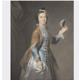
A Girl with a Mask British school Oil on canvas, c.1750–60 NT