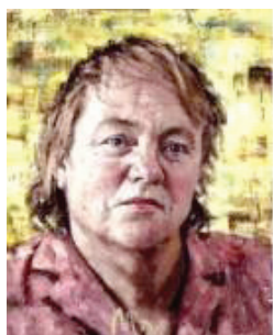
Marjorie 'Mo' Mowlam