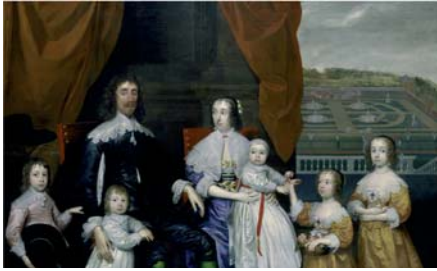
The Capel Family

Here are a two other pictures of families in the Gallery. Choose one of these portraits and draw your family based on the one you like best.