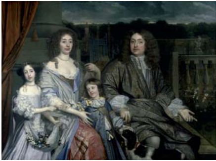
The Vyner Family