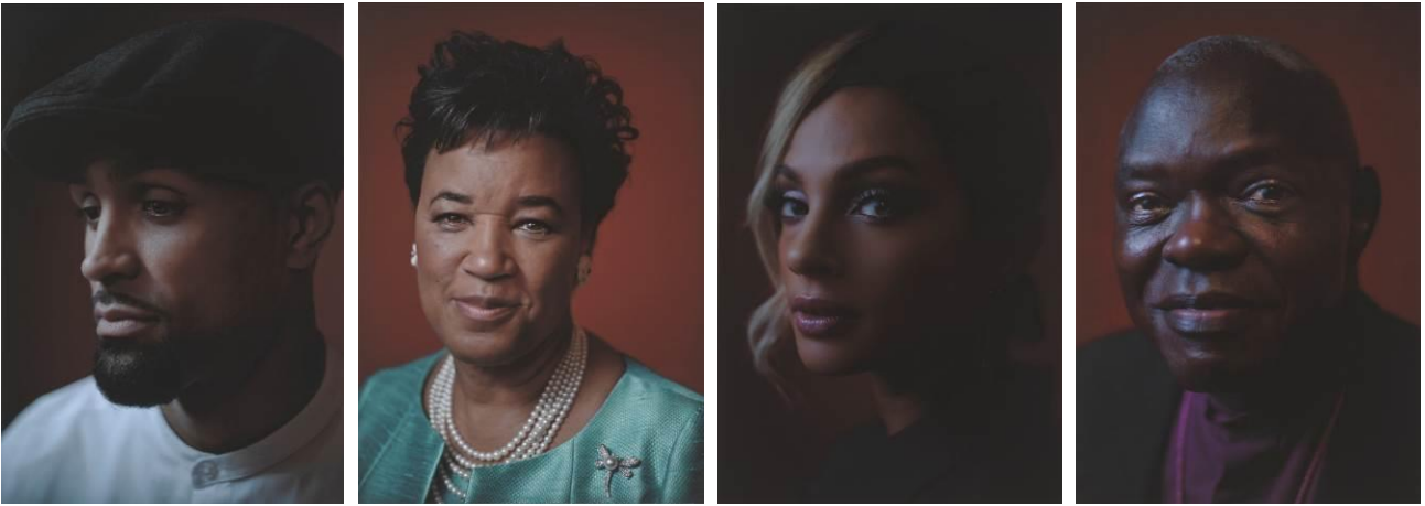
Ashley Banjo by Simon Frederick, 2016; Patricia Scotland, Baroness Scotland of Asthal by Simon Frederick, 2016; Alesha Dixon by Simon Frederick; John Sentamu by Simon Frederick, 2016