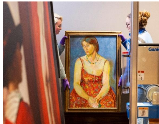
L-R the newly refurbished galleries in The Blavatnik Wing, 2022, Reinstallation of works in The Blavatnik Wing

It was announced today that the Blavatnik Family Foundation has gifted £10 million to the National Portrait Gallery in support of its Inspiring People project. To recognise this generous gift, the most significant in the Gallery's history, the first floor of the renowned building will become The Blavatnik Wing, encompassing nine galleries and covering a momentous period in British history, from 1840 to 1945. The floor will exhibit some of the greatest portraits in the Gallery's Collection and explore society and culture in the 19th and early 20th centuries.