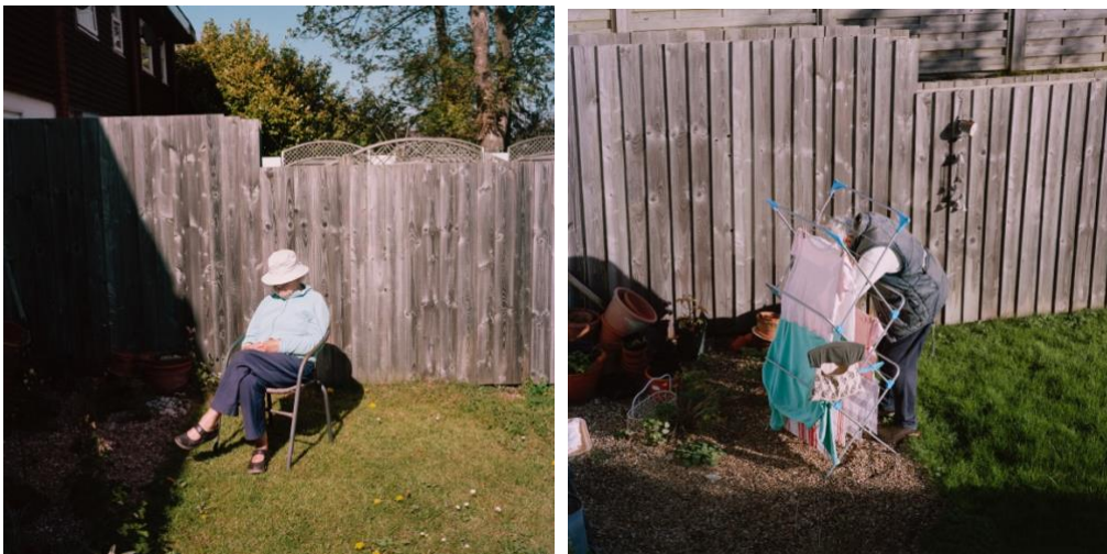
Images L-R: Laundry Day #2 from the series Laundry Day by Clémentine Schneidermann © Clémentine Schneidermann; Laundry Day #3 from the series Laundry Day by Clémentine Schneidermann © Clémentine Schneidermann

Winning portraits go on display at Cromwell Place, South Kensington