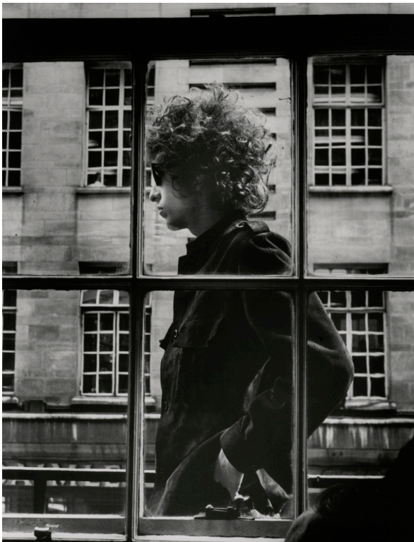
Bob Dylan (detail) by Douglas Eatwell, 1966

American Friends of the National Portrait Gallery aims to encourage appreciation and understanding of the art of portraiture through support of the activities of the National Portrait Gallery in London, and its collaboration with American arts and academic institutions. This support is intended to broaden awareness of the National Portrait Gallery's collections and its activities in the United States, recognize the interest of U.S citizens in these activities, and strengthen appreciation of U.S. and British citizens' common artistic heritage.