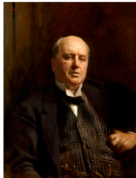
Henry James (detail) by John Singer Sargent, 1913