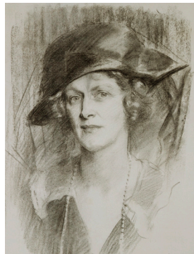
Nancy Astor, Viscountess Astor (detail) by John Singer Sargent, 1923