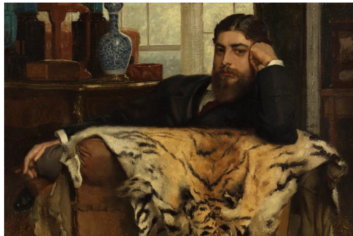
NPG 7135. Algernon Moses Marsden, by James Jacques Joseph Tissot, 1877.

The publication features many of the Gallery's well-known and much loved portraits such as William Shakespeare, the first portrait it acquired, as well as exciting new works acquired for the Collection. This includes the first joint acquisition with the National Gallery, of Algernon Moses Marsden by Jacques Joseph Tissot.