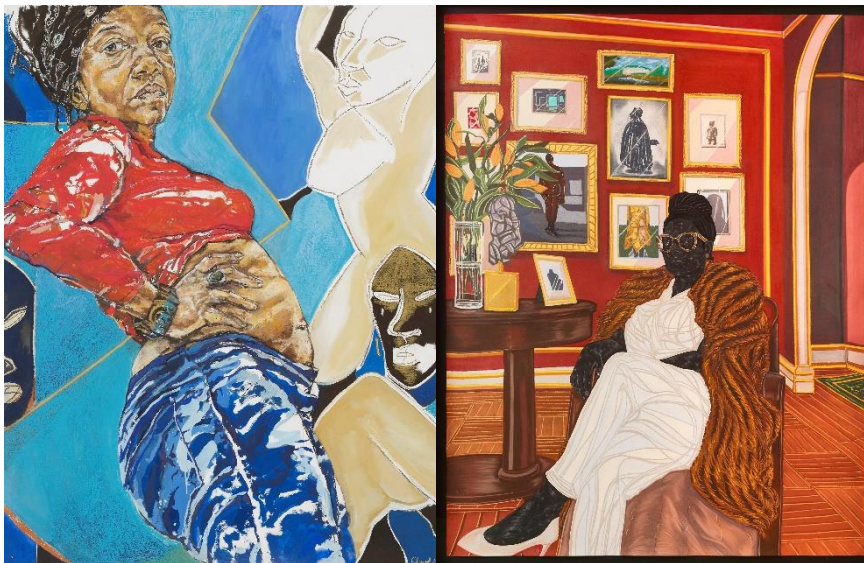
L-R: Standing Figure with African Masks by Claudette Johnson (2018) © Claudette Johnson. Courtesy the artist and Hollybush Gardens, London. The Marchioness by Toyin Ojih Odutola (2016) © Toyin Ojih Odutola. Courtesy of the artist and Jack Shainman Gallery, New York.